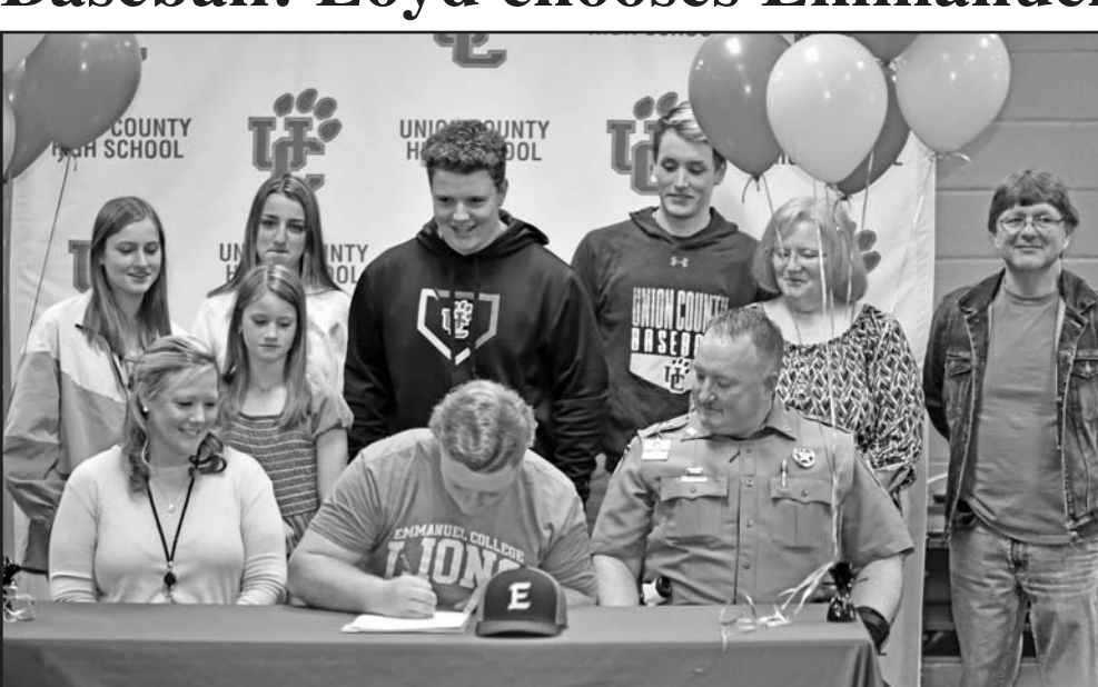
By Todd Forrest